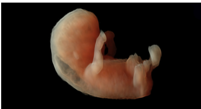
Enlarged NT at 11 weeks visualized with HDlive™

Cell-free DNA analysis screens for the common trisomies by analyzing fragments of fetal DNA in maternal blood as early as 10 weeks of pregnancy. Results do not require data from ultrasound other than gestational age, and performance varies by technology. The landmark NEXT study compared the performance of the Harmony test and FTS for Down syndrome. 38 of 38 cases of Down syndrome were detected by the Harmony test, with a false positive rate of less than 0.1%. 1