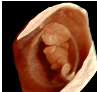
A case of Acrania at 8 weeks visualized with HDlive

While cell-free DNA screening does not require ultrasound to produce a result, the importance of a detailed first trimester ultrasound cannot be overlooked. A detailed first trimester ultrasound can detect malformations that can either occur in isolation or with maternal or genetic disease. 8 Such findings provide early information regarding the health of the pregnancy and can lead to changes in pregnancy management. Similarly, all cases of common aneuploidies may not be detected by ultrasound alone. 9 A paradigm that uses both first trimester ultrasound and targeted NIPT can allow for early, accurate evaluation for clinically relevant conditions.