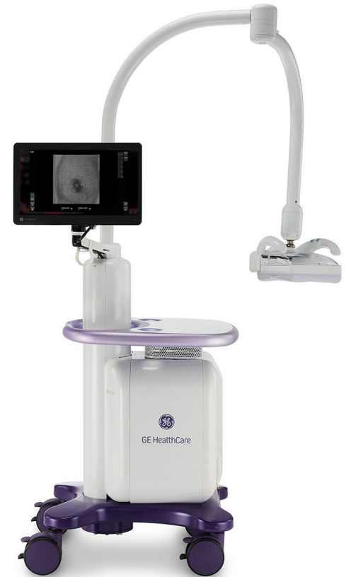
Invenia™ ABUS Premium