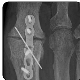
With Helix™ 2.2