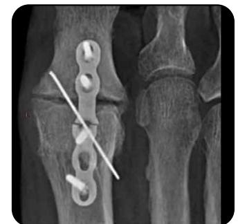
Without Helix™ 2.2