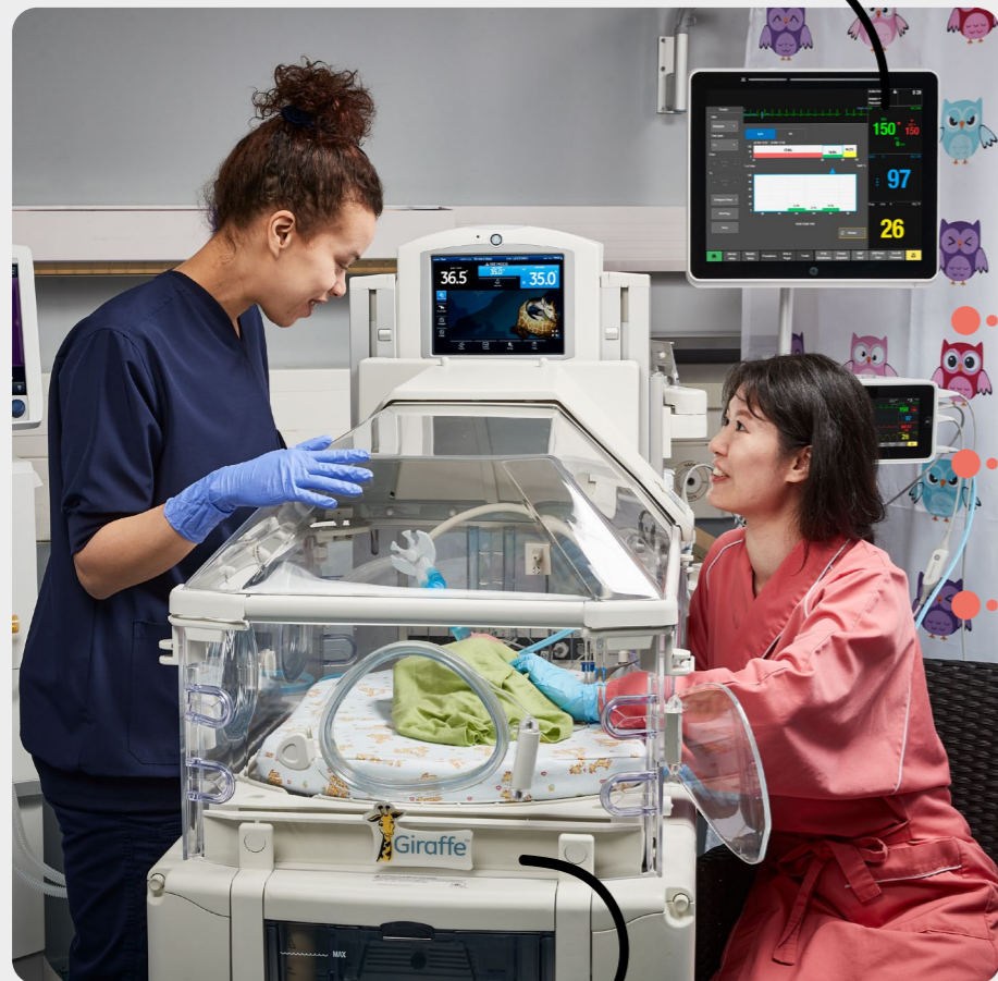
Giraffe™ OmniBed™ Carestation™