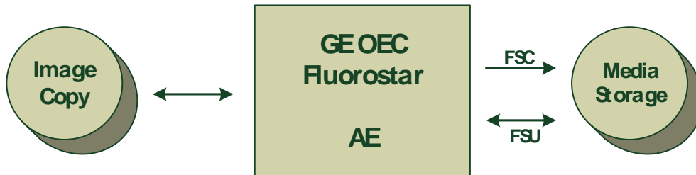
Illustration 3-1 GE OEC Fluorostar Media Interchange Application Model And Data Flow Diagram