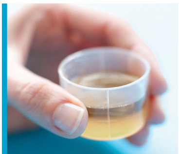
1 hour preinjection

At least one hour before the dose of DaTscan, you will be given another drug to reduce the thyroid's accumulation of iodine 123