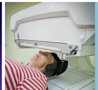
Scan time: 30 min

The images of your brain will be taken three to six hours after administration of DaTscan. Normal daily activity, including eating and drinking, may occur during this time