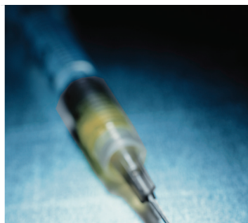
Injection of DaTscan

At least one hour before the dose of DaTscan, you will be given another drug to reduce the thyroid's accumulation of iodine 123