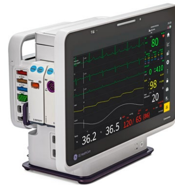
Carevance D15 Dock with Carevance H1 Hub