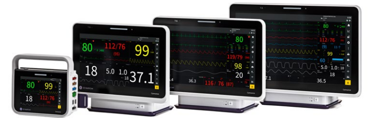
Carevance™ patient monitors