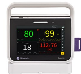
Carevance H1 Hub with Carevance D7 Mini Dock