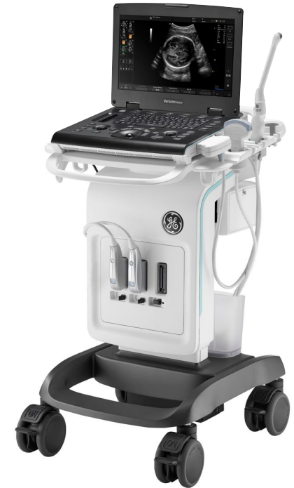
Versana Active™ Ultrasound