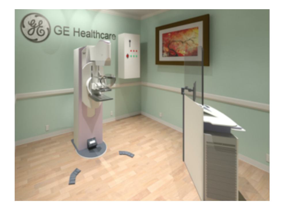
9-38 SENOGRAPHE PRISTINA

Hold the Left Click for Rotating around Use the Scroll for Zooming in and out Hold Left click + Ctrl Key to change perspective