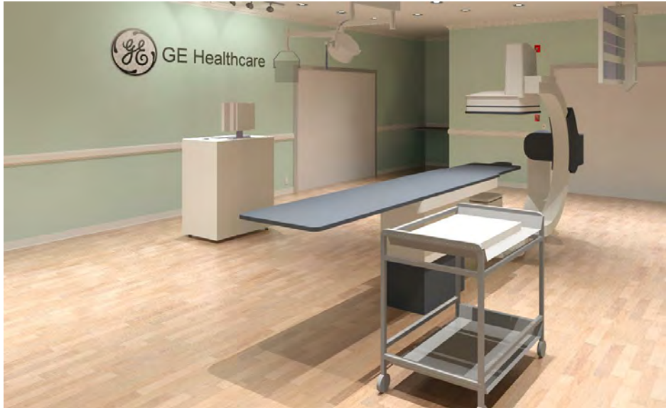
4-58 - Single-Plane - Innova 2100-3100-4100 Unity

Hold the Left Click for Rotating around Use the Scroll for Zooming in and out