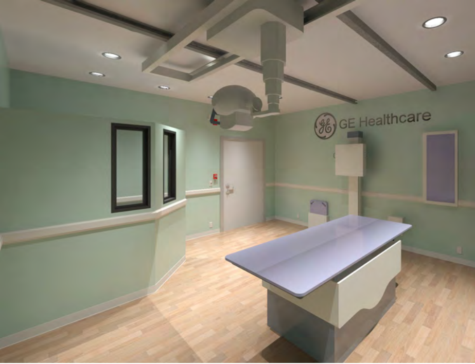
1-124 - Proteus XRa

Hold the Left Click for Rotating around Use the Scroll for Zooming in and out