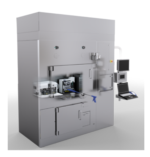
TRYGG hot cell<sup>†</sup>