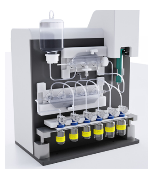
KLAR closed aseptic dispenser<sup>†</sup>

Enabling closed aseptic conditions is the GE patented cap design where the septa are pierced inside the sealed bag right before mounting onto the dispensing unit. After the dispensing process, the needles are automatically removed and the vials can then be delivered out from the TRYGG hot cell.