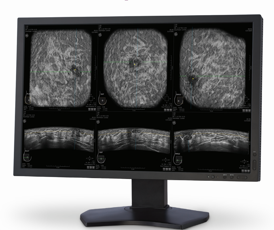
Invenia ABUS Viewer displays 3D volumes in a patented, 2-mm-thick coronal slice.

Invenia ABUS 2.0 uses the powerful cSound<sup>™</sup> Imageformer, a software-based graphics processor, that provides a reproducible and operator-independent acquisition method to achieve consistent, high quality results. cSound imaging allows significantly more data to be collected and used to create every image. Traditional hand-held ultrasound parameters such as focal zones and gain are automatically optimized. Because no image manipulation is required, high image quality is consistent from operator to operator with the touch of a button.