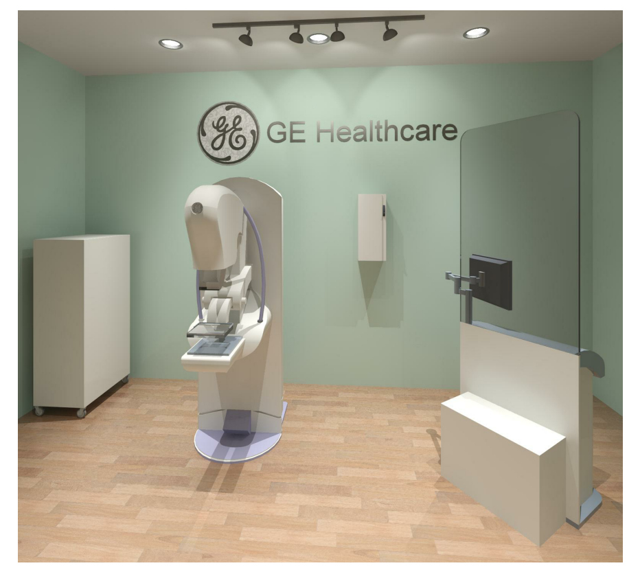
9-34 - SenoClaire

Hold the Left Click for Rotating around Use the Scroll for Zooming in and out