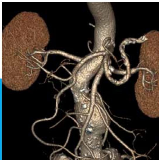
Figure 1: Pre-operative CTA showing anatomical details of the aneurysm and the branched vessels.

Next, during the procedure, modern technology lets us benefit from three-dimensional (3D) information through pre-operative CT or intra-operative C-arm CT acquisitions. These methods have many advantages in terms of deploying the stent graft in the correct position, catheterizing the branch vessels, and placing the bridging stents.