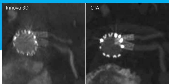
Figure 4: Innova 3D image performed at the end of the procedure that demonstrates the patency of the renal arteries. The follow up CTA confirmed that information.