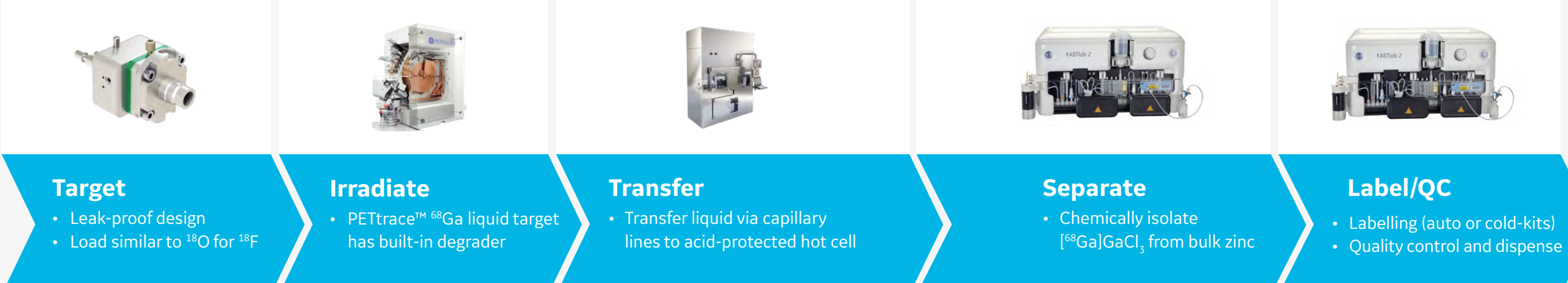
Figure 2 – High level workflow for cyclotron production. Images may not be representative.

The liquid target workflow is summarised below.