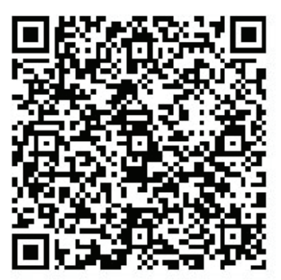
Point your camera at the QR code. Tap the banner that appears on your screen.

GE HealthCare is a leading global medical technology, pharmaceutical diagnostics, and digital solutions innovator dedicated to providing integrated solutions to make hospitals more efficient, clinicians more effective, therapies more precise, and patients healthier. Learn more at www.gehealthcare.com.