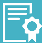
Table of Contents Icon Key:

These courses have been approved for Category A or A+ ASRT approved CE credits. All registered technologists who attend the entire course are eligible to receive CE. Total eligible CE credits are dependent on duration of the course chosen.