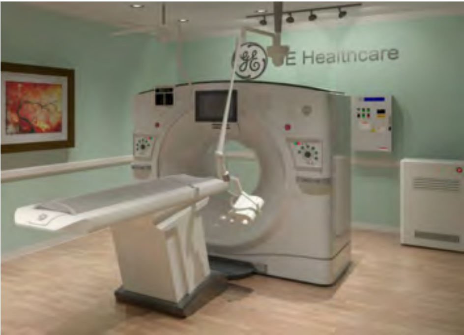
Revolution Frontier w/1700 Table

Hold the Left Click for Rotating around Use the Scroll for Zooming in and out