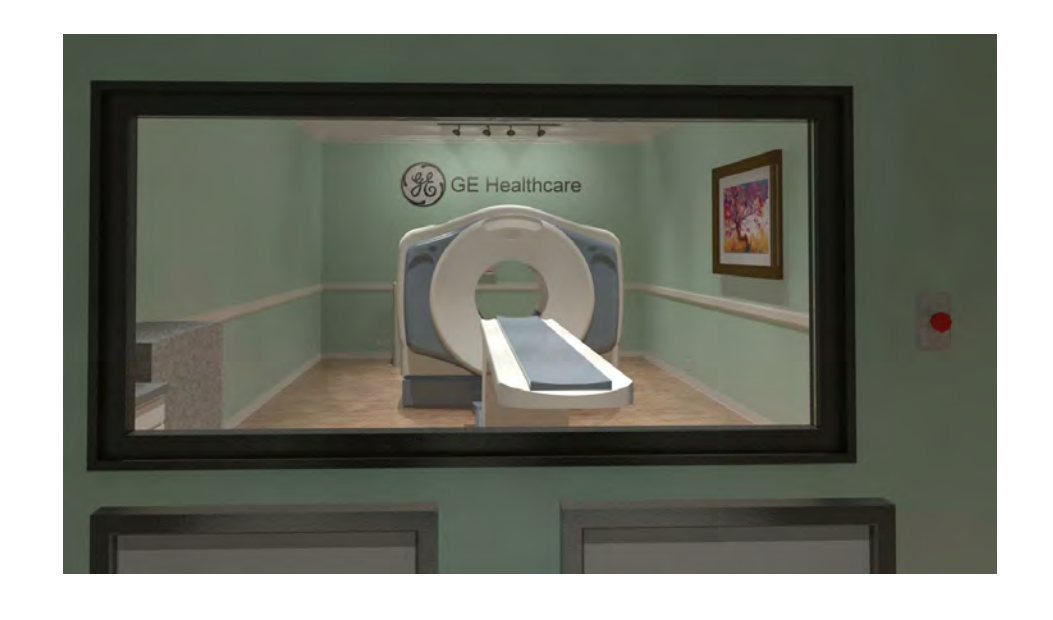
6-70 - Discovery CT750 HD w-2000 Table

Hold the Left Click for Rotating around Use the Scroll for Zooming in and out