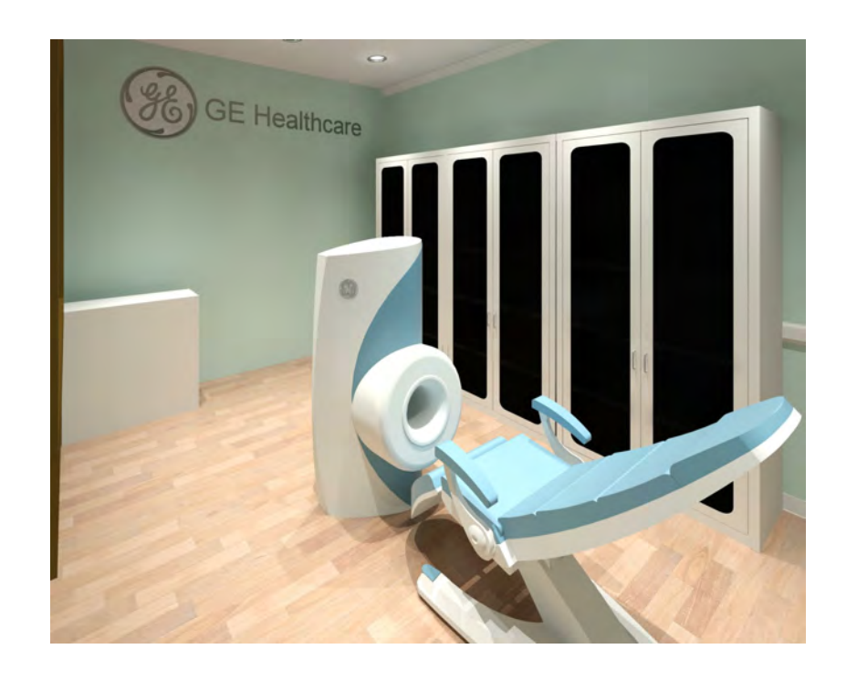
8-234 - ONI Optima 1.5T MR430s Extremity

Hold the Left Click for Rotating around Use the Scroll for Zooming in and out