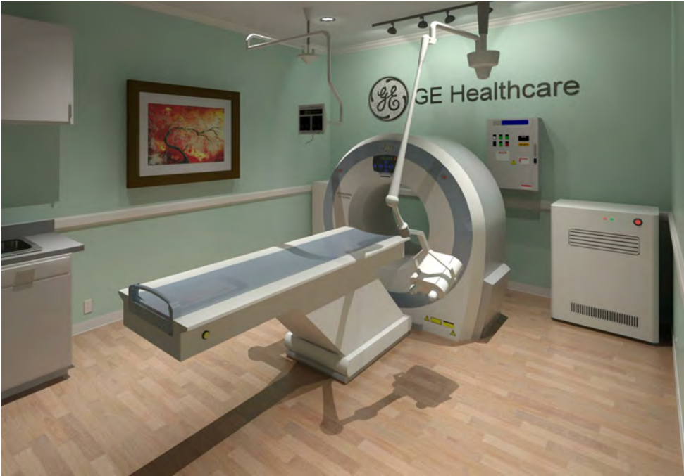
6-108-Revolution ACTs 8 Slice

Hold the Left Click for Rotating around Use the Scroll for Zooming in and out