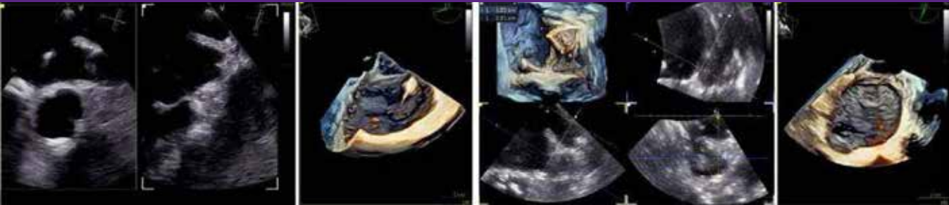
Supplementary Figure 1. Echocardiographic images from the interventions in patients #2-4. Bi-plane view of the LAA, 3D imaging from left atrium of the ostium of LAA, 3D measurement of the landing zone with multiplanar reconstruction and final visualization with the device after deployment are shown. For patient 3, it is also included the angiographic visualization of the LAA with contrast.