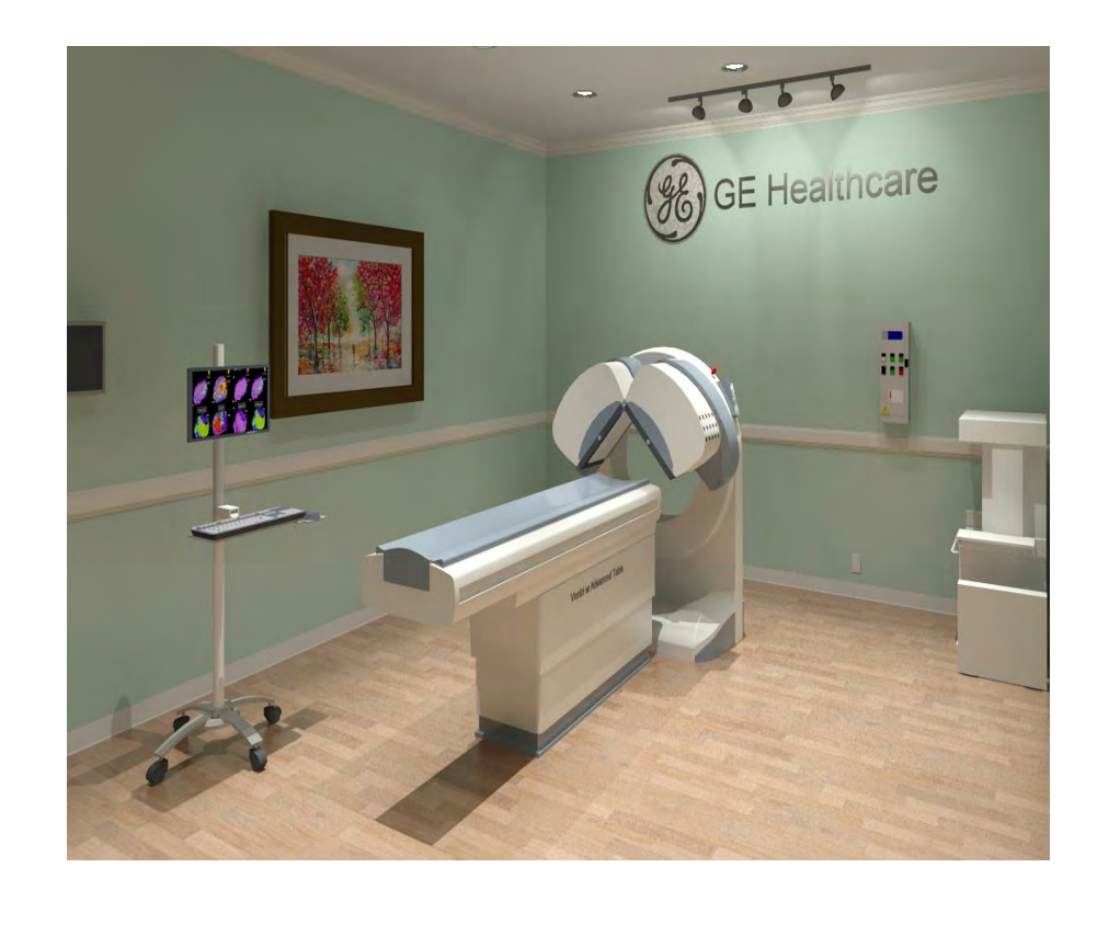
7-86 - Ventri w Advanced Table

Hold the Left Click for Rotating around Use the Scroll for Zooming in and out