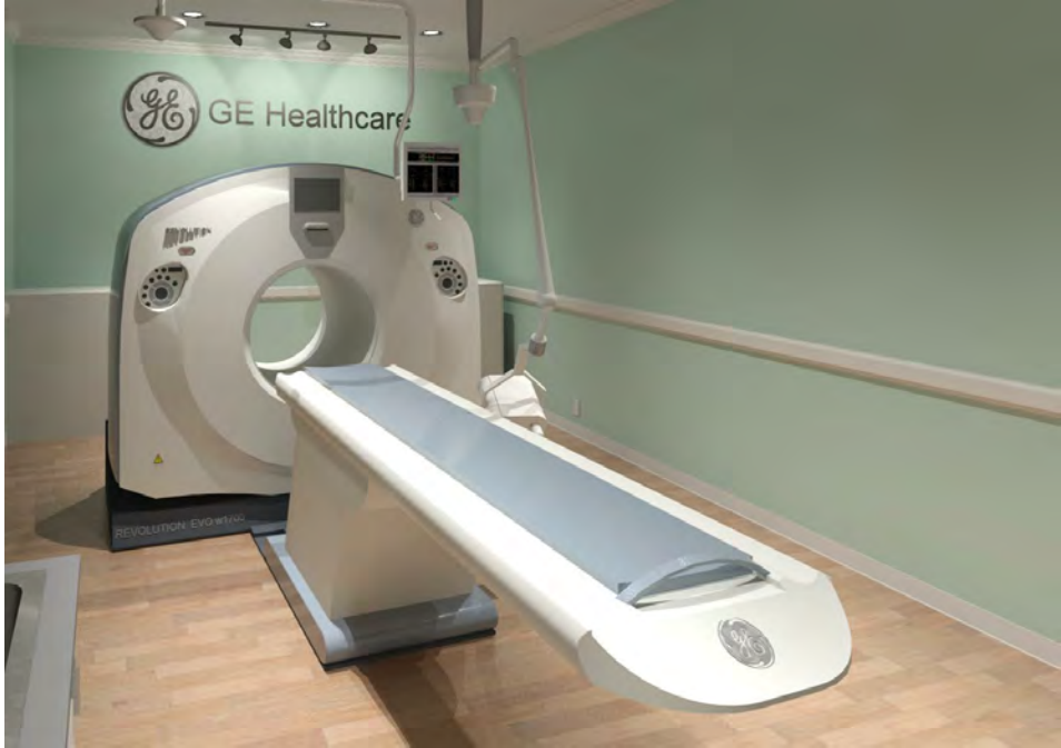
6-98 Revolution EVO w1700 Table

Hold the Left Click for Rotating around Use the Scroll for Zooming in and out