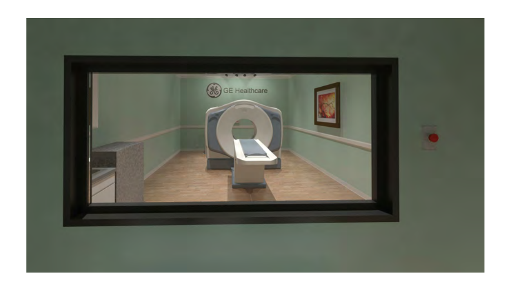
6-68 - Discovery CT750 HD w-1700 Table

Hold the Left Click for Rotating around Use the Scroll for Zooming in and out