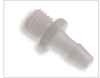
Male Screw to 5/32" ID Barbed, Plastic Compatibility: GE DINAMAP Part # 300664 (Qty: 10)