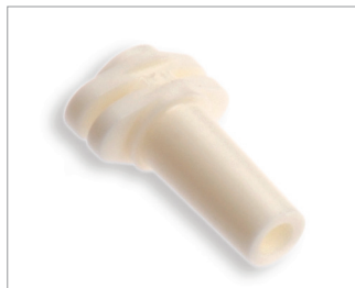
Washing Plugs for Screw Connector Cuffs Compatibility: GE DINAMAP Part # 300877 (Qty: 50)