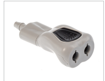
1T DINALICK Female Recept for single lumen hoses Compatibility: DINACLICK Male Plug Part # 2055630-001 1/8" tube (Qty: 10)