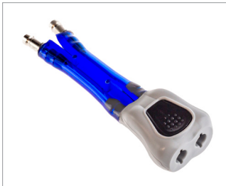
X, 2 Male Bayonet to DINACLICK Female Recept Compatibility: User Modified Part # 2059292-001 (Qty: 10)