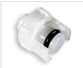
Washing Plugs for Submin Connector Cuffs Compatibility: GE, GE Marquette, Protocol Part # 330072 (Qty: 50)

GE Healthcare provides wash plugs that block water from entering the BP cuff during cleaning.