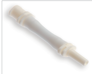
1 Male Micro Plug to 1 Female Locking Luer-Neonatal Compatibility: Spacelabs Part # 330088 (Qty: 10)