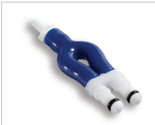
Y, 1 Male Slip Luer to Neo-Snap Male Plug Compatibility: Philips/HP, Siemens, Datascope, Spacelabs Part # 2059290-001 (Qty: 10)