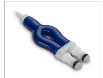
Y, 1 Male Barb 3/32" to Neo-Snap Male Plug Compatibility: Philips Part # 2059290-004 (Qty: 10)