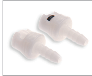
Mated Pair Submin to 1/8" ID Barbed, Plastic Compatibility: GE Datex-Ohmeda Part # 330058 (Qty: 10)