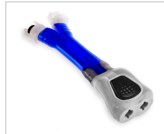
X, 2 Mated Submin to DINACLICK Female Recept Compatibility: GE Datex-Ohmeda Part # 2059292-003 (Qty: 10)