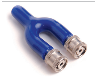
Y, 1 Unfitted to 2 Female Screw Connectors Compatibility: Unfitted Part # 330048 (Qty: 1)