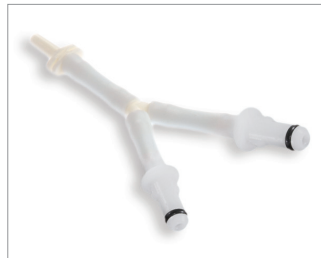
Male Micro Plug to 2 Neo-Snap Male Plug Compatibility: Spacelabs Part # 2059290-002 (Qty: 10)