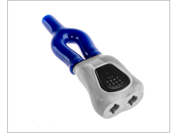
Y, 1 Unfitted to DINACLICK Female Recept Compatibility: Unfitted Part # 2059291-004 (Qty: 10)