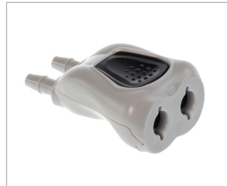
2T DINACLICK Female Recept to 1/8" ID tubing, dual lumen hoses Compatibility: DINACLICK Male Plug Part # 2059294-001 (Qty: 10)