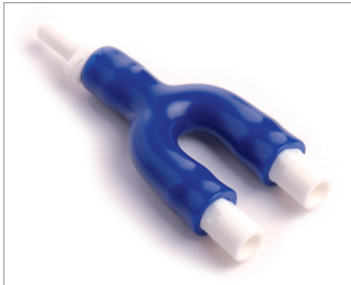
Y, 1 Male Slip Luer to 2 Female Slip Luers-Neonatal Compatibility: Philips/HP, Siemens, Datascope, Spacelabs Part # 330049 (Qty: 1)