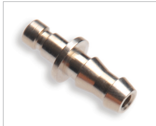
Male Bayonet to 3/16" ID Barbed, Metal Compatibility: Philips/HP, Siemens, Datascope, Colin Part # 330059 (Qty: 10)