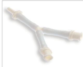
Y, 1 Male Micro Plug to 2 Female Locking Luers-Neonatal Compatibility: Spacelabs Part # 330078 (Qty: 10)