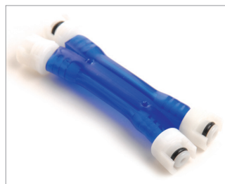
X, Mated Pair Submins to 2 Male Submins Compatibility: GE Datex-Ohmeda Part # 330085 (Qty: 10)