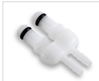
2T Neo-Snap Male Plug Compatibility: Neo-Snap Female Part # 2059293-001 (Qty: 10)