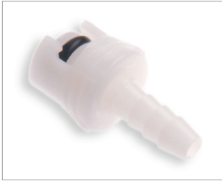
Male Submin to 1/8" ID Barbed, Plastic Compatibility: GE, GE Marquette, GE Datex-Ohmeda Part # 330091 (Qty: 10)