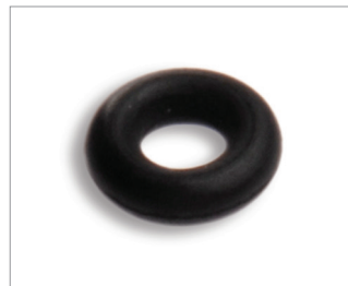
O-Ring Replacement Set for Air Hose Instrument Connector Compatibility: (330073) and Air Hoses (107365, 107368, 107366) Part # 330077 (Qty: 20)