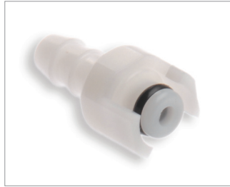
Male Submin to 5/32" ID Barbed, Plastic Compatibility: GE, GE Marquette, GE Datex-Ohmeda Part # 330090 (Qty: 10)