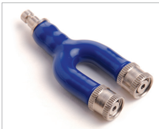
Y, 1 Male Bayonet to 2 Female Screw Connectors Compatibility: Philips/HP, Siemens, Datascope, Colin Part # 330046 (Qty: 1)