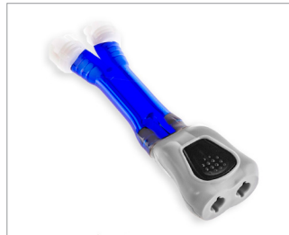
X, 2 Female Submin to DINACLICK Female Recept Compatibility: GE Marquette Part # 2059292-002 (Qty: 10)