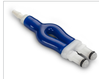
Y, 1 Male Barb 1/8" to Neo-Snap Male Plug Compatibility: Philips, Welch Allyn Part # 2059290-003 (Qty: 10)