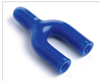
Y, 1 Unfitted to 2 Unfitted Compatibility: Unfitted Part # 300829 (Qty: 1)