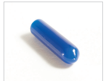
Washing Plugs for Neo-Snap Female Recept and DINACLICK Male Plug Compatibility: GE Part # 2059295-001 (Qty: 50)