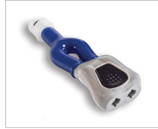
Y, T Male Submin to DINACLICK Female Recept Compatibility: Nihon Kohden Part # 2059291-003 (Qty: 10)