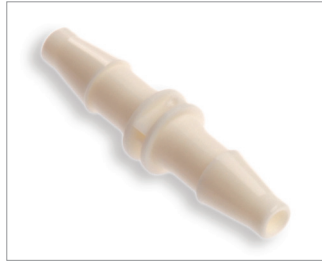
5/32" ID Barbed to 5/32" ID Barbed, Plastic Compatibility: Airhose Connector Part # 300670 (Qty: 10)