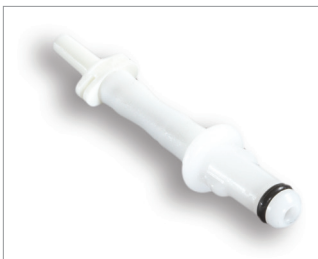
Male Micro Plug to 1 Neo-Snap Male Plug Compatibility: Spacelabs Part # 2059297-001 (Qty: 10)