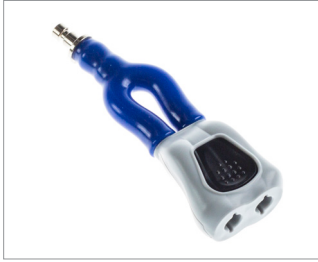
Y, 1 Male Bayonet to DINACLICK™ Female Recept Compatibility: Philips/HP, Siemens, Datascope, Colin Part # 2059291-001 (Qty: 10)