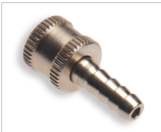
1/8" ID Barbed to Female Screw, Metal Compatibility: GE DINAMAP Part # 300619 (Qty: 2)