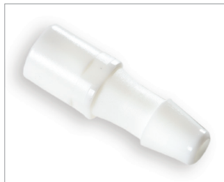
5/32" ID Barbed to Female Slip Luer Compatibility: Universal Neonatal Part # 330068 (Qty: 10)