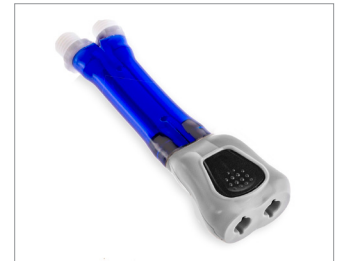
X, 2 Male Screw to DINACLICK Female Recept Compatibility: DINAMAP Part # 2059292-004 (Qty: 10)