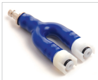
Y, 1 Male Bayonet to 2 Male Submins Compatibility: Philips/HP, Siemens, Datascope, Spacelabs Part # 330080 (Qty: 10)