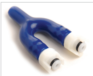
Y, 1 Unfitted to 2 Male Submins Compatibility: Unfitted Part # 330084 (Qty: 10)