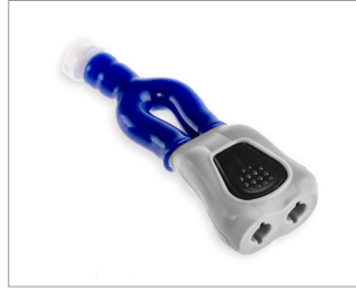
Y, 1 Female Submin to DINACLICK Female Recept Compatibility: Protocol Part # 2059291-002 (Qty: 10)