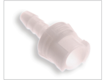
Female Submin to 1/8" ID Barbed, Plastic Compatibility: GE, GE Marquette, Protocol Part # 330064 (Qty: 10)