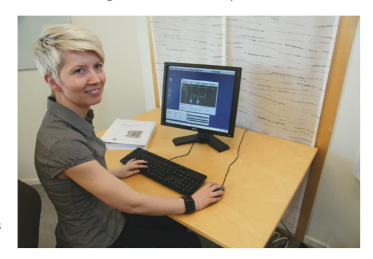
PETtrace 800 user interface

Target media, cooling water and helium cooling are supplied to the target through a single manifold attached to the rear of each target with a quick-connector. The design of the PETtrace 800 mounting flange and targets permits rapid and convenient installation and removal of the targets to minimize dose exposure.