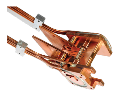
PETtrace 800 ion source