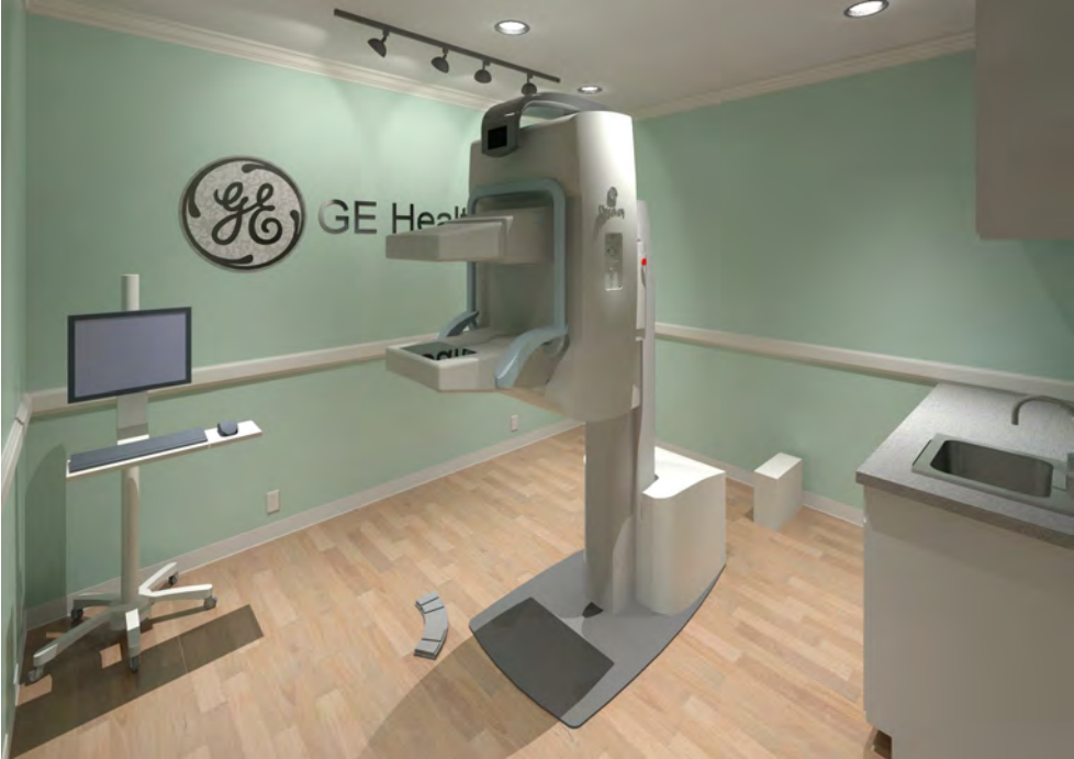
Discovery NM 750b

Hold the Left Click for Rotating around Use the Scroll for Zooming in and out