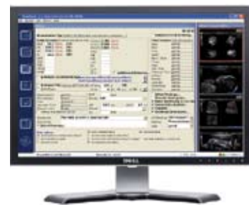
Split screen mode