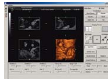
Integrated 4D View Software