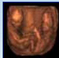
Fetal twins, week 15