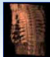
Fetal spine, week 26

For more information or to order, contact your local GE Ultrasound Service or Sales Representative at 1 888 202-5528.