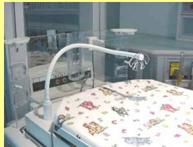
Tubing Management Arm