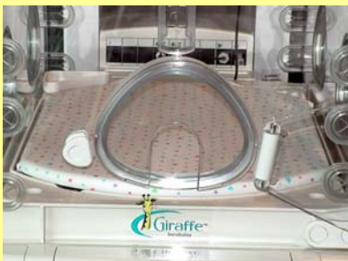
High Frequency Oscillatory Vent (HFOV) Porthole Cover