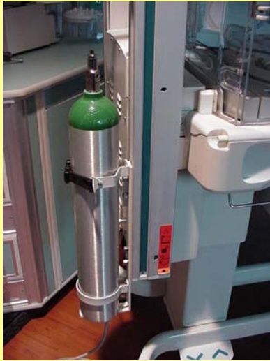
Easy-Load E-Cylinder Holder