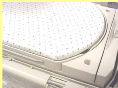
Fitted Mattress Sheet