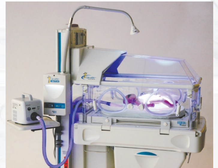
Giraffe SPOT PT Lite shown working in conjunction with the BiliSoft LED Phototherapy System.

We call it Maternal-Infant Care Re-imagined.