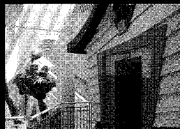
Lutheran Children's Hospital