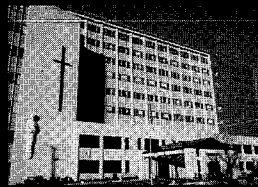
St. Joseph Hospital & Anthony Medical Center