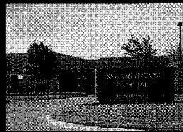
Rehabilitation Hospital of Fort Wayne