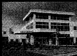
Dupont Hospital & Dupont Medical Park